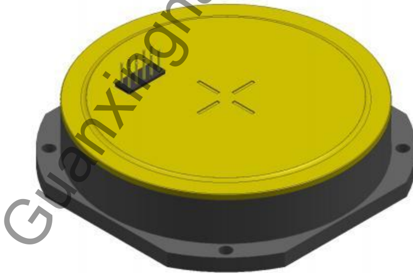
Fig 1 GNGFA61AY-240